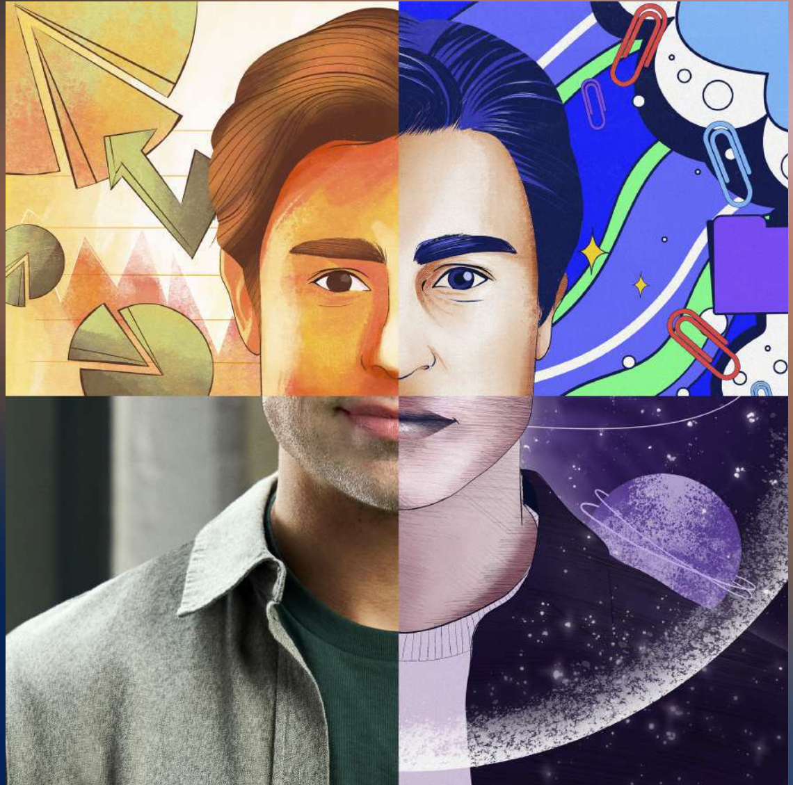
My best me