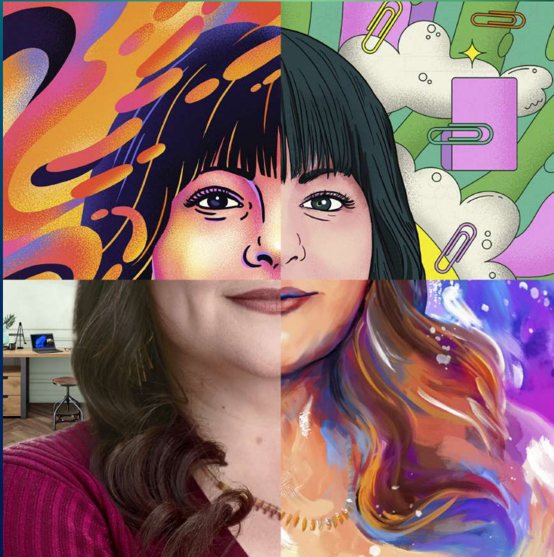
My best me