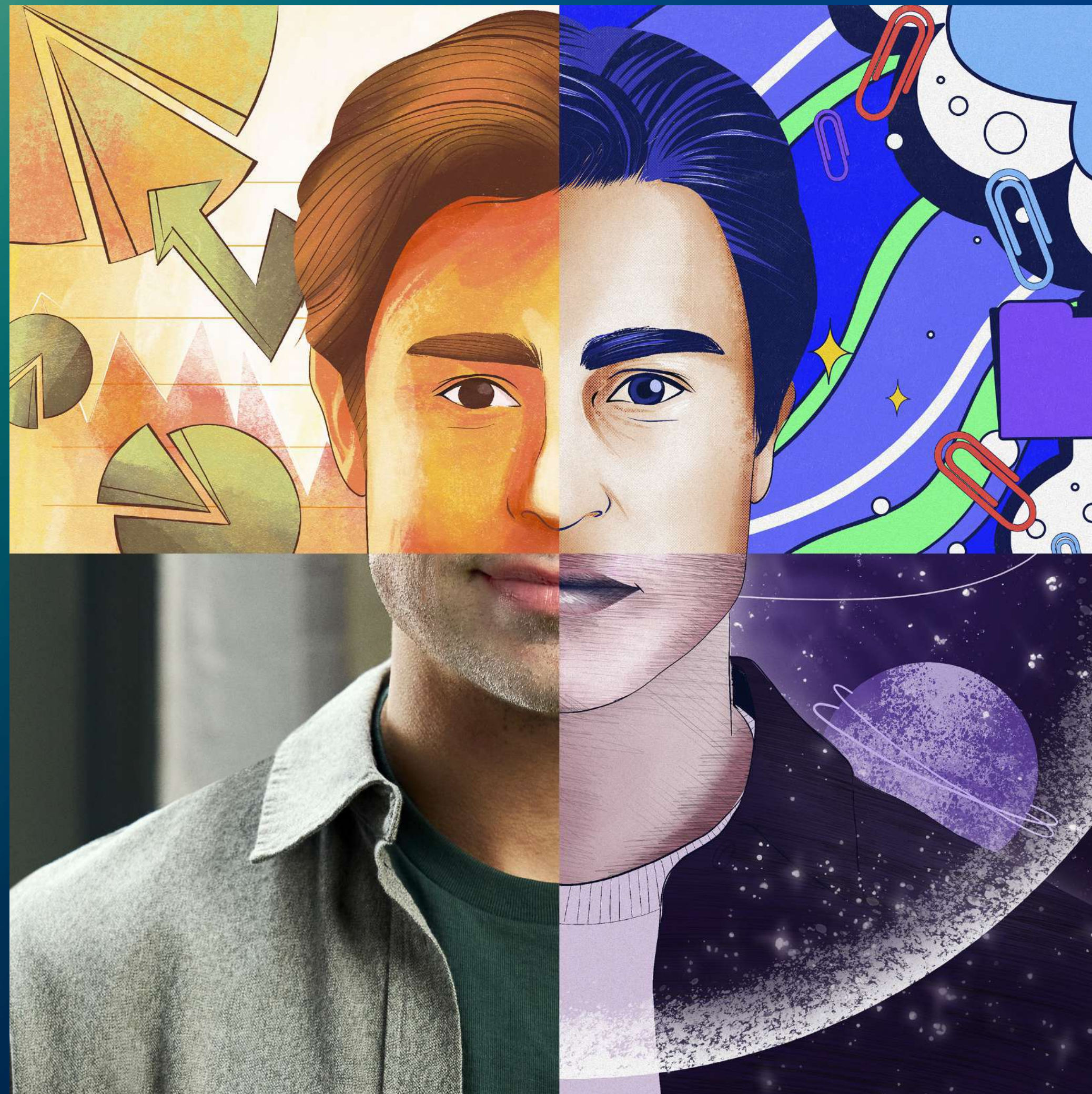
My best me