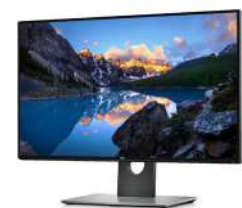
DELL ULTRASHARP 27 MONITOR | U2718Q

Hear every word clearly on your next call with the Dell Pro Stereo Headset, optimized to provide in-person call quality.