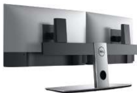
DELL DUAL MONITOR STAND | MDS19

Give your workspace a modern and clean appearance with a stylish wireless keyboard and mouse that perfectly complements your PC.