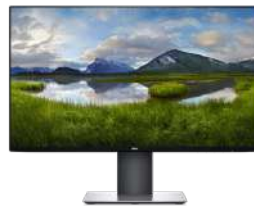
DELL ULTRASHARP 24 MONITOR | U2419H

Work at full speed with Dell's powerful Thunderbolt Dock. Charge your system faster, support up to three 4K displays and connect to your peripherals via a single cable.