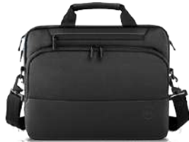
DELL PRO BRIEFCASE 14 / 15 | PO1420C/PO1520C

Connect your Latitude to almost any device with a convenient 6-in-1 compact adapter.