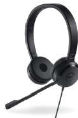
DELL PRO STEREO HEADSET | UC350

This space-saving stand, mounts up to two 27-inch monitors, providing the screen real estate you need to be most productive.