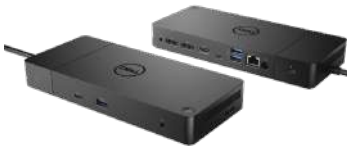
DELL THUNDERBOLT DOCK | WD19TB

Work at full speed with Dell's powerful Thunderbolt Dock. Charge your system faster, support up to three 4K displays and connect to your peripherals via a single cable.